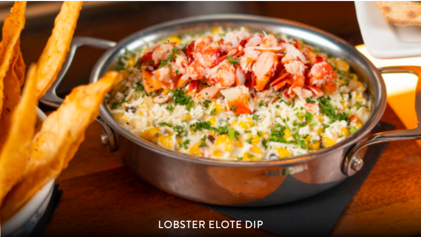
LOBSTER ELOTE DIP