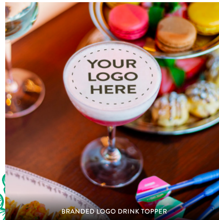
BRANDED LOGO DRINK TOPPER