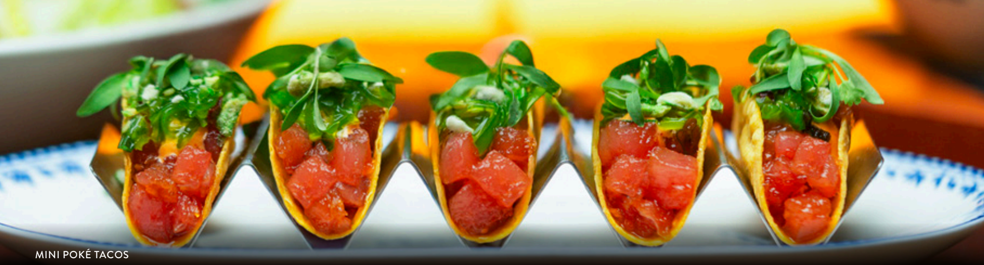
MINI POKÉ TACOS